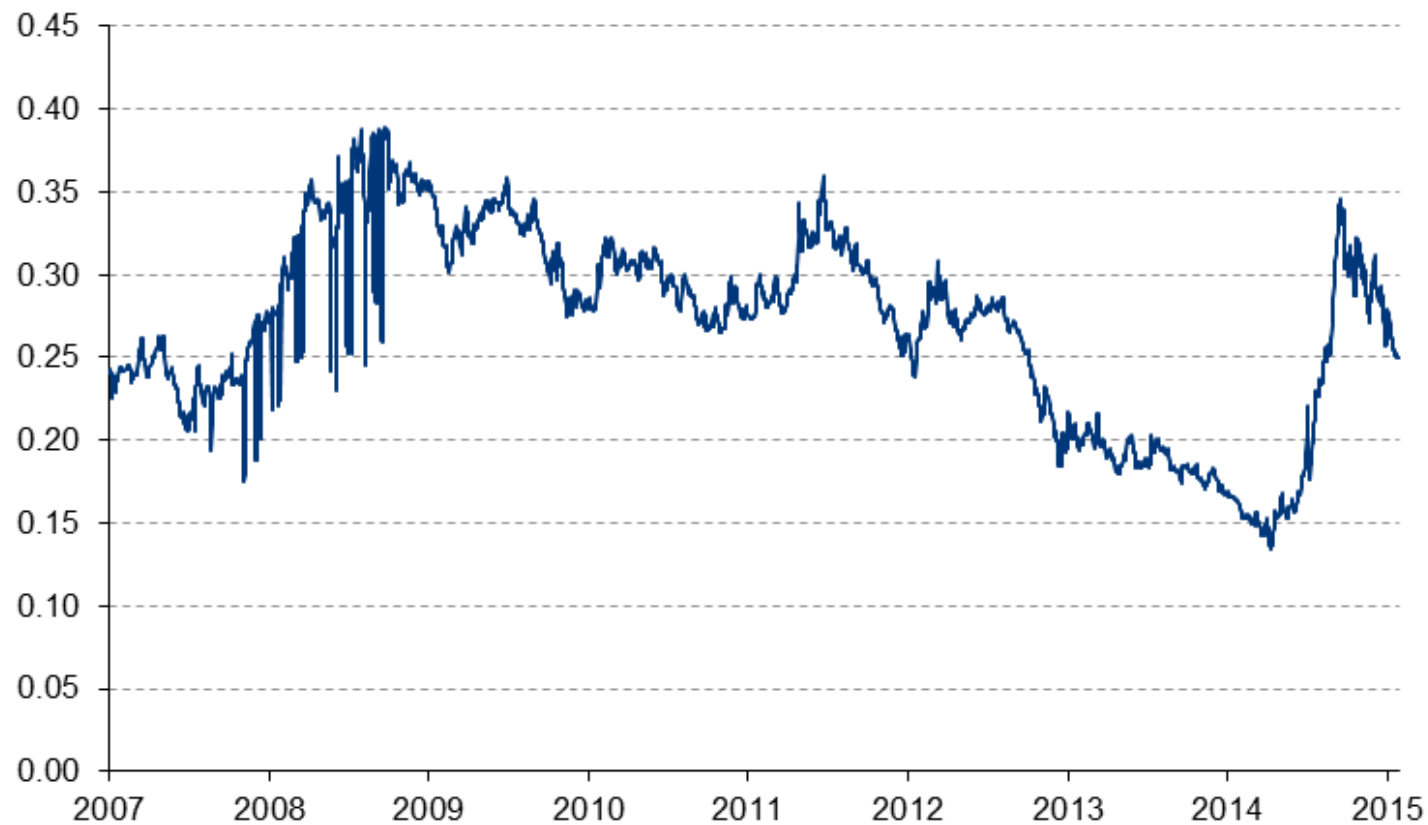
Standard deviation of oil price probability distribution (1y WTI futures)